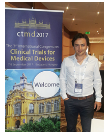
At the 3rd International Congress on Clinical Trials for Medical Devices 2017, in Budapest, Hungary.