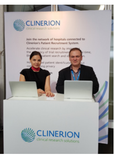
At eHealth Tallinn, in Tallinn, Estonia.