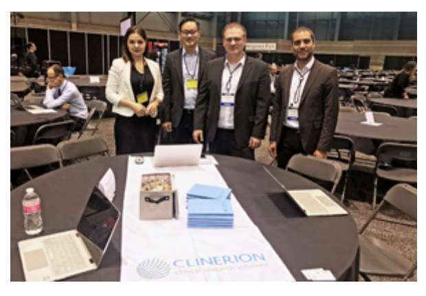
The Clinerion team at the 2018 ASCO Annual Meeting, Chicago, IL, June, 2018.