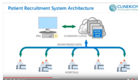
Clinerion's NEW "Anonymized Identification" (ANID) Technology