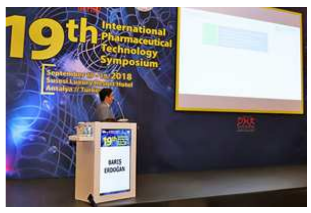
Clinerion's Head of EEMEA also spoke at the International Pharmaceutical Technology Symposium at Haceteppe University on "The importance of Real World Data in clinical and epidemiological research". September, 2018. Find out more >